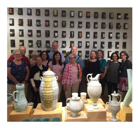
In 2018, EFV members toured the Clay Museum.

To learn more about Violet Oakley, see Woodmereartmuseum.org – this is one of the virtual tours currently offered by museums that are closed due to COVID-19.