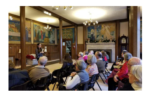
A curator from the Woodmere Art Museum spoke to Village members about the Violet Oakley murals in the First Presbyterian Church in Germantown.

To learn more about Violet Oakley, see Woodmereartmuseum.org – this is one of the virtual tours currently offered by museums that are closed due to COVID-19.